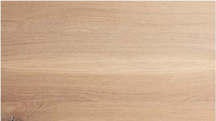
CASK American White Oak

Our products are crafted from American White Oak, American Black Walnut, and American Hard Maple. These quintessential hardwoods are considered among the most durable. They are finished with a durable, UV-resistant, matte top coat. Our region is net positive in tree harvesting and we take care in our sourcing to see that nothing goes to waste. As part of our commitment to sustainability, we initiated our “Tree for Every Top” program in 2021. For every tabletop we sell, we plant a sapling in our community as an investment in the environment.