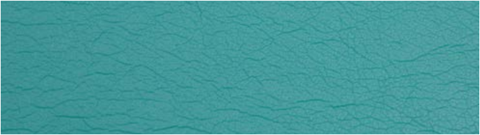
OPTIMA - MYSTIC Kravet Vinyl