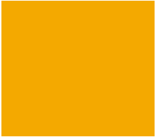
MELON YELLOW Metal

The Optima collection by Kravet is a polyester knit-backed vinyl.