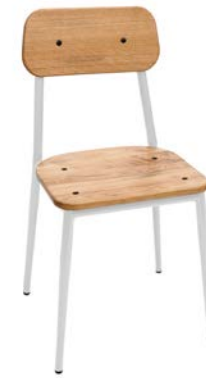
DALTON DINING CHAIR

Biscuit Belly uses unique powder coats to match seating like the Dalton chair and Warren chair to their brand colors. The Quincy banquette features a vertical channeled back cushion in a bright turquoise vinyl fabric that brings life to their interior spaces.