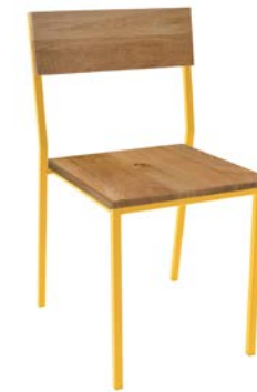
WARREN DINING CHAIR