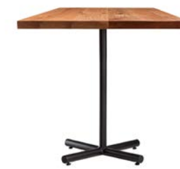
22" W X-BASE DINING TABLE

Our X-Base and T-Base tables have been a longtime favorite for many of our clients. Their simple design allows for great versatility and they blend in with many design styles.