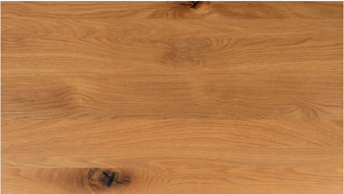
NATURAL American White Oak