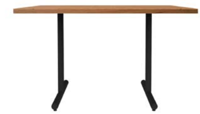
22" T-BASE DINING TABLE